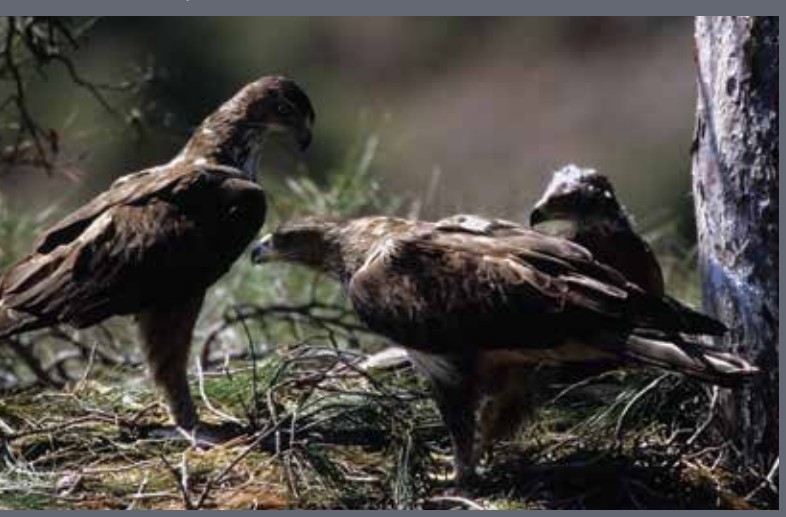
Bonelli's Eagle