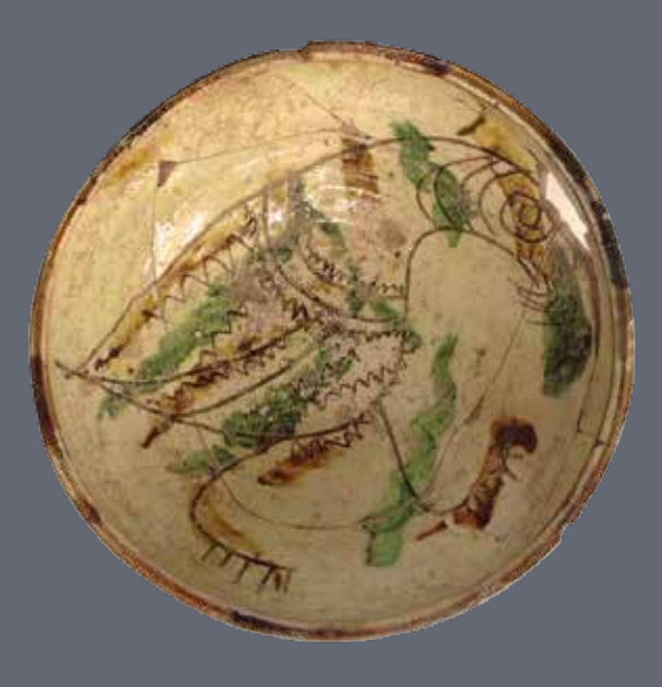
Glazed bowl Sgraffito decoration depicting a bird (possibly a falcon), 13th century AD

Statues of priests with eagles in their hands reveal the symbolic importance of these birds, in all likelihood as elements of power and authority. By contrast, the dove, being Aphrodite's bird par excellence, is represented with female figures and considered a symbol of love and childbearing. The goose, the duck and small birds are depicted with children, often in relief representations where they are probably featured as pets.