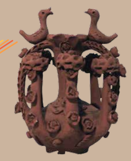
Clay vessel from the village of Foini decorated with two birds in relief on the handles, 19th century AD